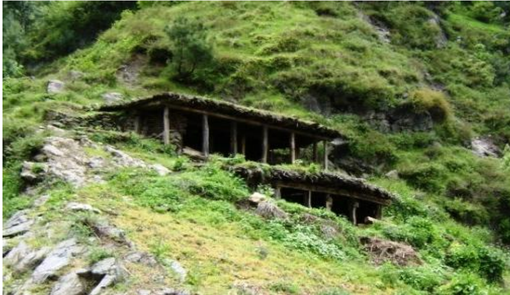
Figure 2. Summer huts of local residents in Grey goral habitat in Machiara National Park.