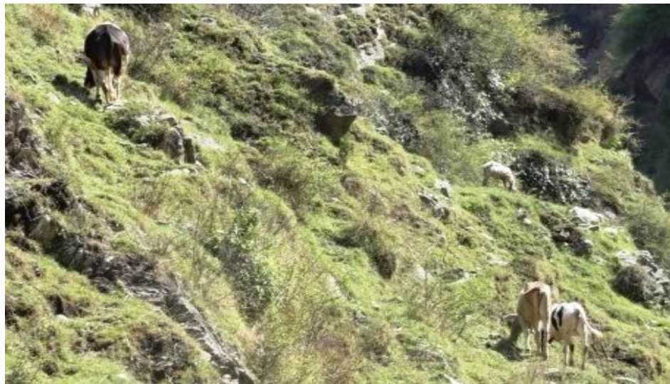
Figure 1. Livestock grazing in and around Grey goral habitat in Machiara National Park.