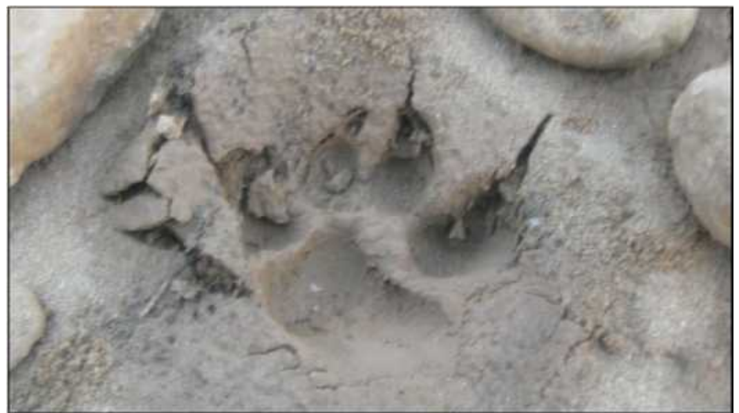
Figure 1. Pug marks of grey wolf in Lehri village

Threats: The major threats to grey wolf and Asiatic jackal population in the Lehri Nature Park included loss of habitat, biotic pressure by human i.e. grazing, fuel wood collection and human- wolf conflict due to depredation on their livestock. The part of the potential habitat of grey wolf and Asiatic jackals was disturbed by military exercises i.e. firing which has resulted in shifting of many wildlife species particularly Punjab Urial from the study area. Presently, wolf mainly relieson goats and sheep for food. However, wolves face more persecution from local shepherds as compared to nomadic shepherds. The grey wolf was persecuted by shooting, smokingin their dens and diggingout dens to kill the pups (Jhala, 2003).