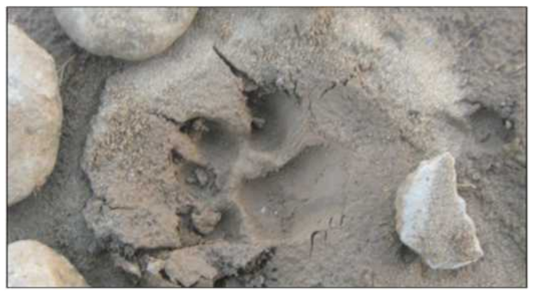
Figure 2. Pug mark of grey wolf in Burden village