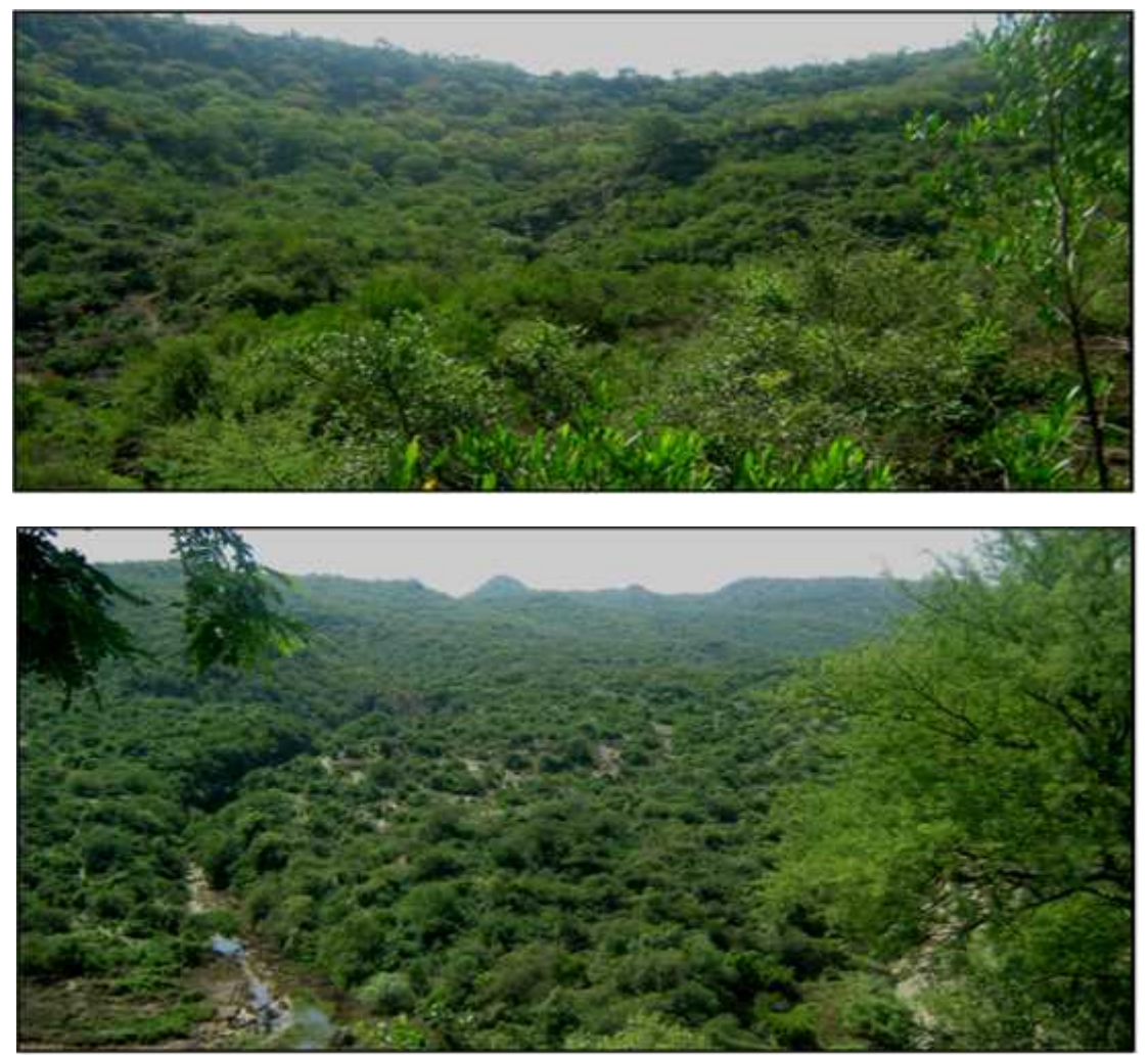
Fig 3 (a and b). Potential habitat of Grey wolf in north of the study area near Mangla dam.